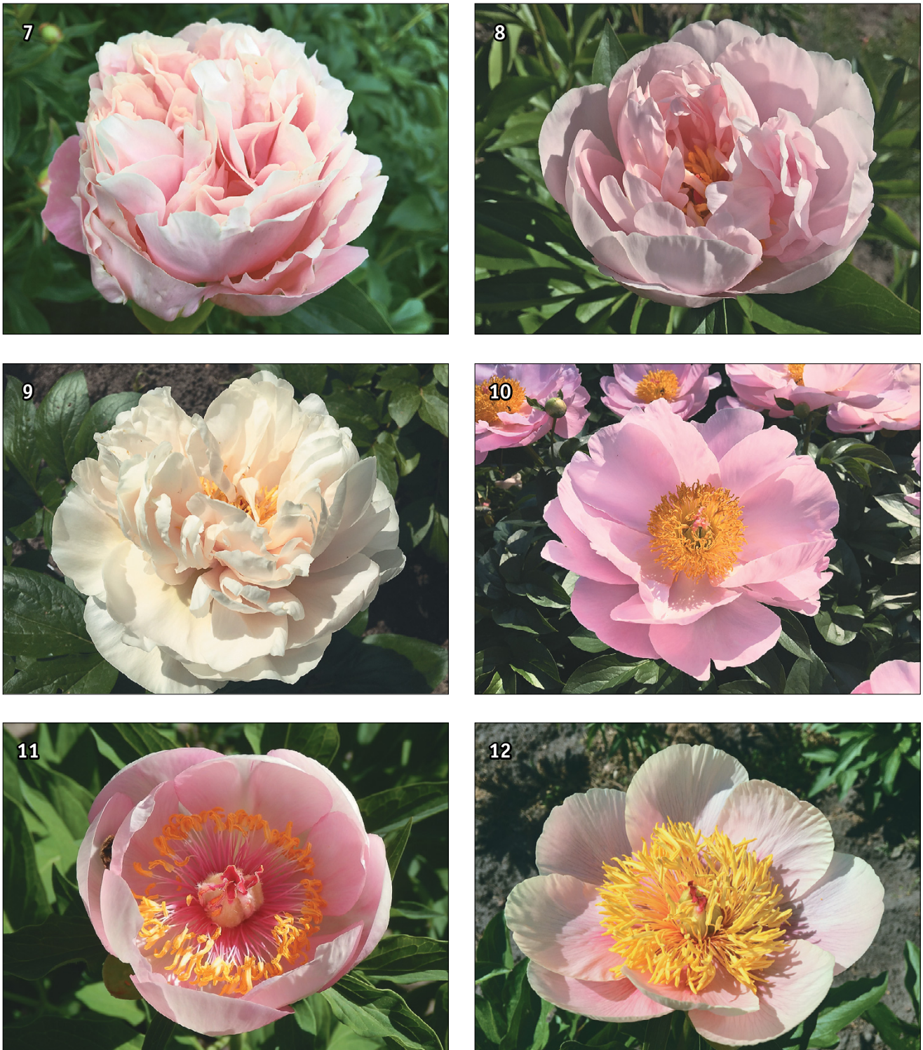
Fig. 3. Flowers of modern peony varieties of Herbaceous Hybrid Gp of yellow, cream, cream-pink color promising for breeding work and decorative gardening: 1. 'Lemon Chiffon' (Reath D. L., 1981), 2. 'Sunny Boy' (Laning, 1985), 3. 'Sunny Girl' (Laning, 1985), 4. 'Quitzin' (Fawkner, 2001), 5. 'Triphena Parkin' (Fawkner, 2009), 6. 'Pastelegance' (Seidl, 1989), 7. 'Pastelorama' (Seidl / Bremer, 2013), 8. 'Pink Vanguard' (Seidl / Hollingsworth, 2005), 9. 'Greenland' (Pehrson / Seidl, 1989), 10. 'Dreamtime' (Seidl / Bremer, 2013), 11. 'Vesniane Defile' (Gorobets, 2014), 12. 'Golden Wings' (Pehrson / Hollingsworth, 1994)

ning of flowering is a varietal characteristic, which strongly depends on the natural and climatic conditions of the region of introduction. However, the correlation between varie-